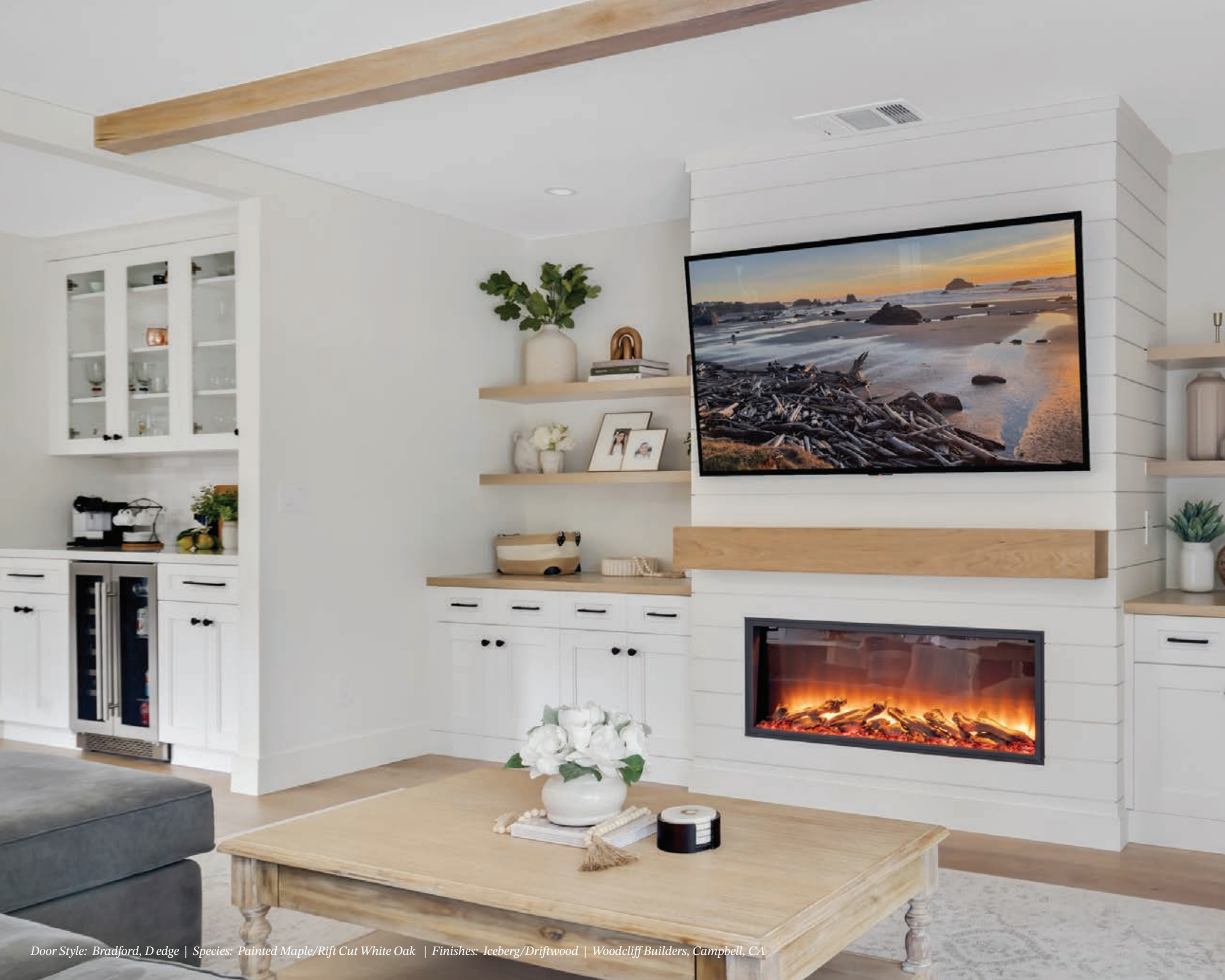
Door Style: Bradford, D edge | Species: Painted Maple/Rift Cut White Oak | Finishes: Iceberg/Driftwood | Woodcliff Builders, Campbell, CA