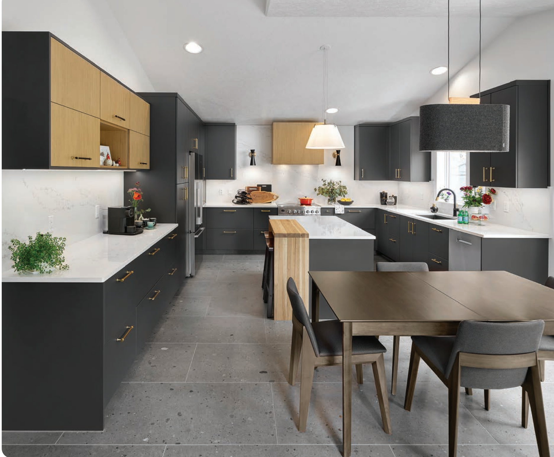
Door Style: Modena/Salinas, D and G edges | Species: Painted HDF/Eco Composite Veneer Rift White Oak | Finishes: Midnight Shadow/Natural | Cucina Bella, Edmonton, AB