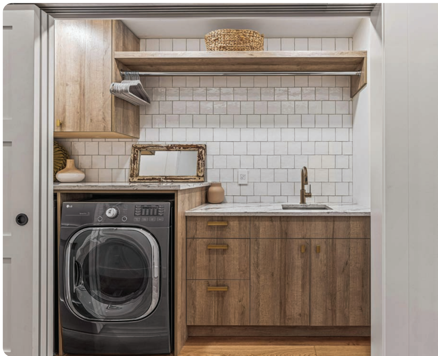
Door Style: Valencia/Dover, G edge | Species: TFL Registered Embossed laminate/HPL Super Matte High Pressure Laminate Finishes: Tobacco/Polaris Black | Bow Valley Kitchens, Calgary, AB