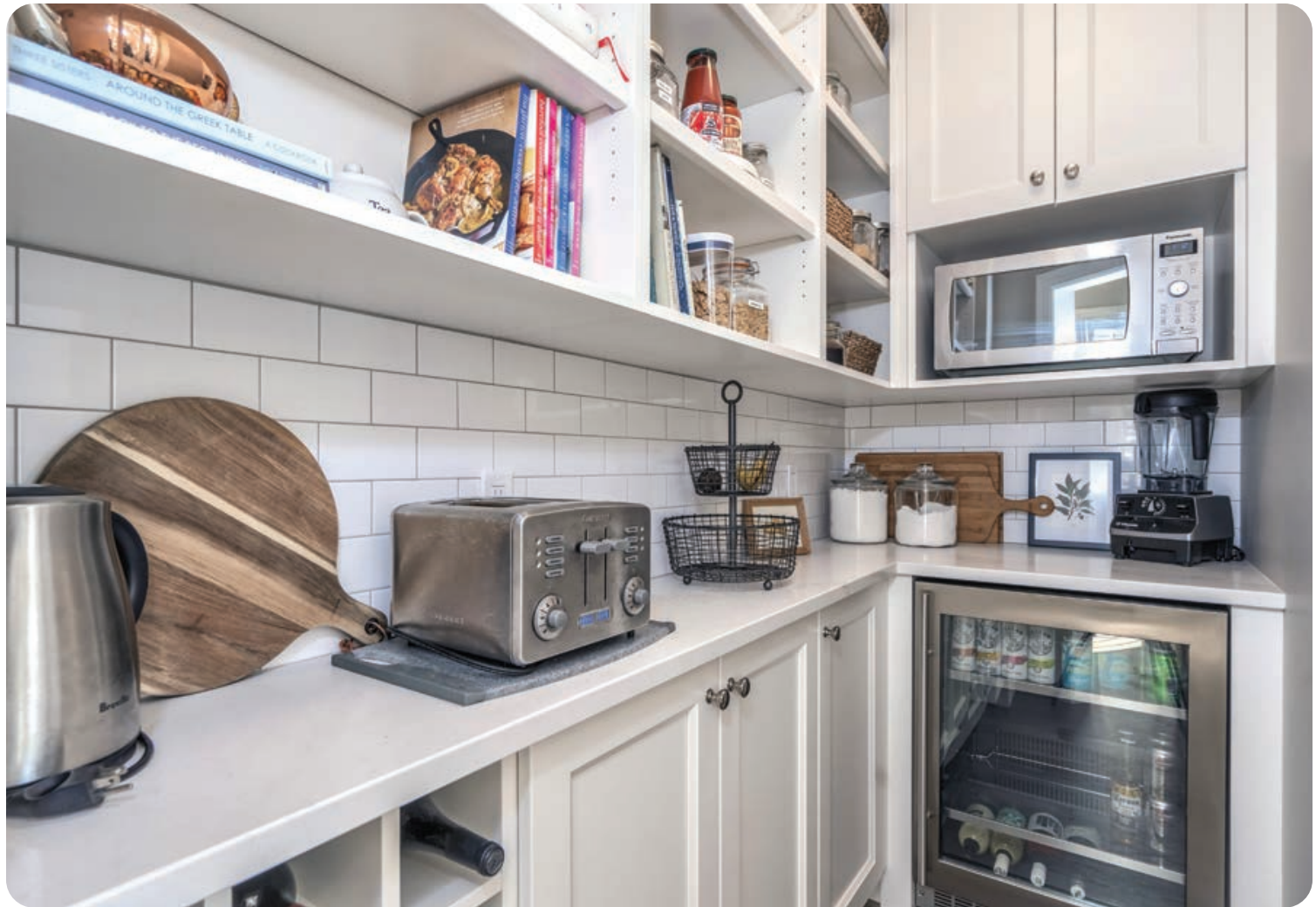
Door Style: Mission, D edge | Species: Painted Maple | Finishes: Cloud White | Blue Mountain Kitchens, Maple Ridge, BC