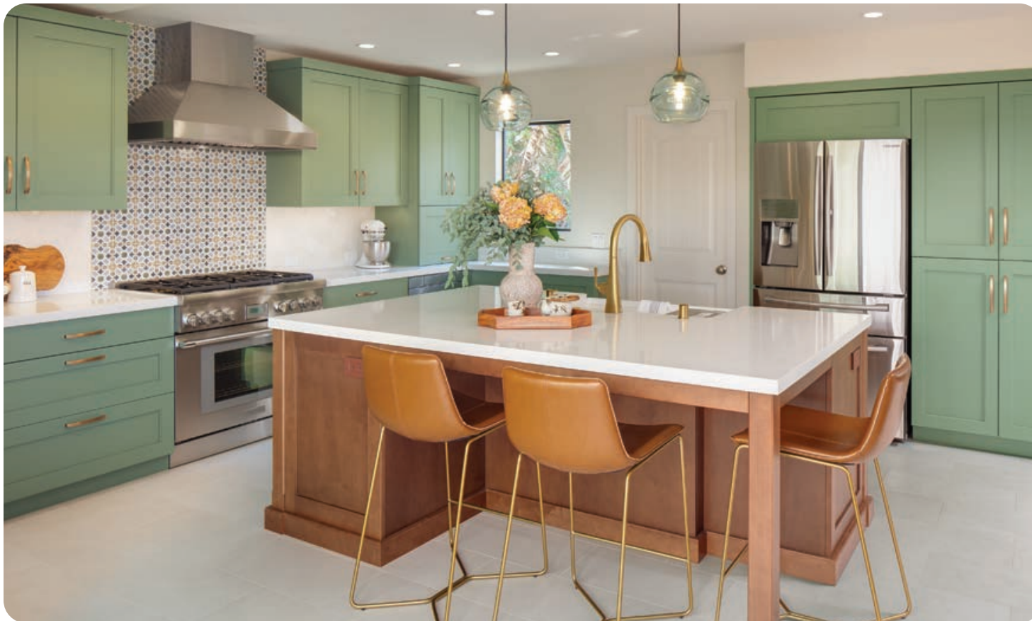
Door Style: Bradford, D edge | Species: Painted Maple/Maple | Finishes: Custom Color - Benjamin Moore Kennebunkport Green, HC-123/Roasted Almond | Design Studio West, San Diego, CA

Adding a pop of color to your cabinet design instantly injects energy and individuality, setting it apart from the norm. It's a perfect way to express your taste and make a bold statement in your home. While Sollera offers an extensive selection of stylish standard finishes, we understand that designing your dream space is personal, and therefore offer custom color-matching to the hue of your choice. Every Sollera cabinet is made to order, which means we make it just for you according to your specifications, including your desired finish. What better way to create a space unique to you?