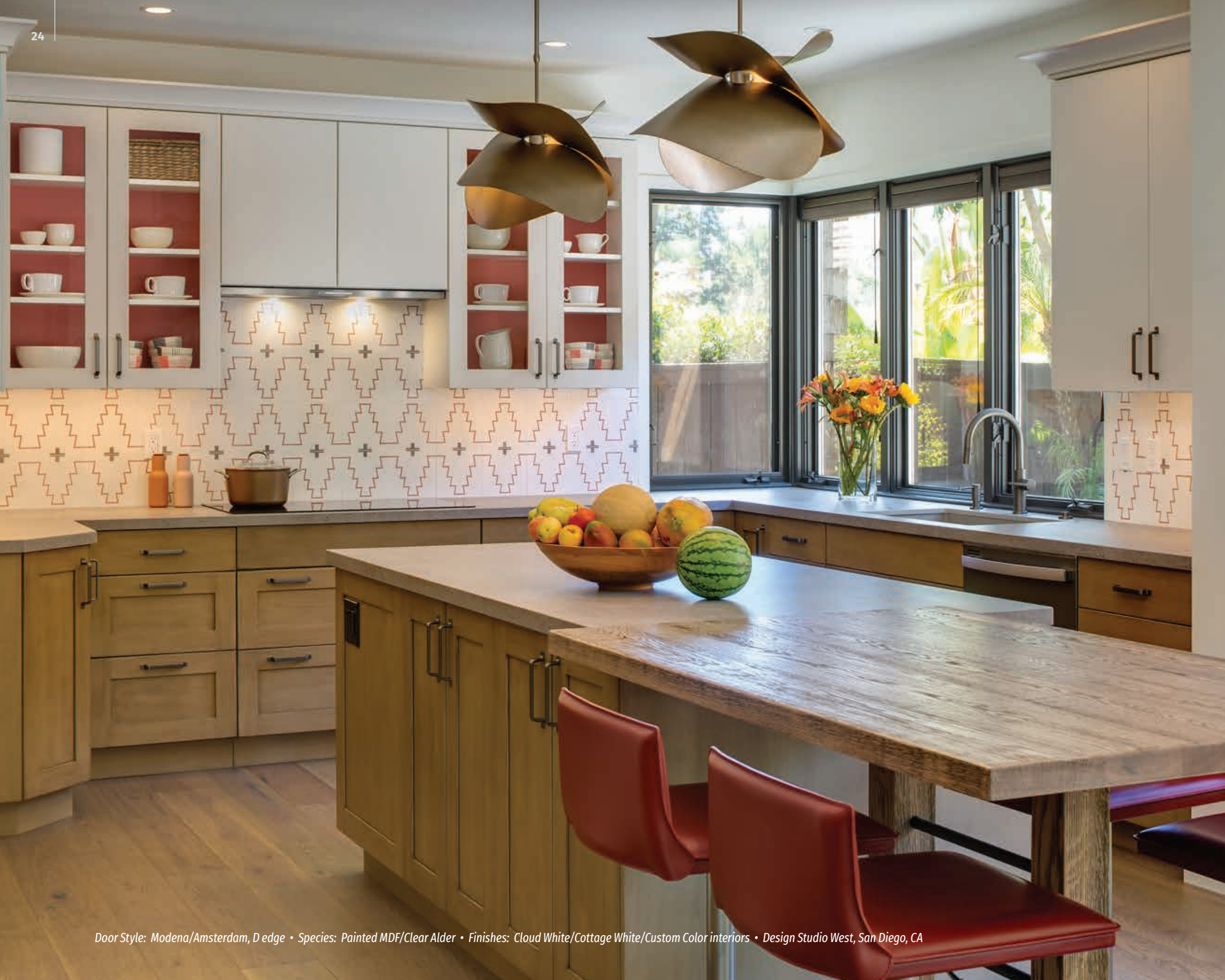
Door Style: Modena/Amsterdam, D edge • Species: Painted MDF/Clear Alder • Finishes: Cloud White/Cottage White/Custom Color interiors • Design Studio West, San Diego, CA