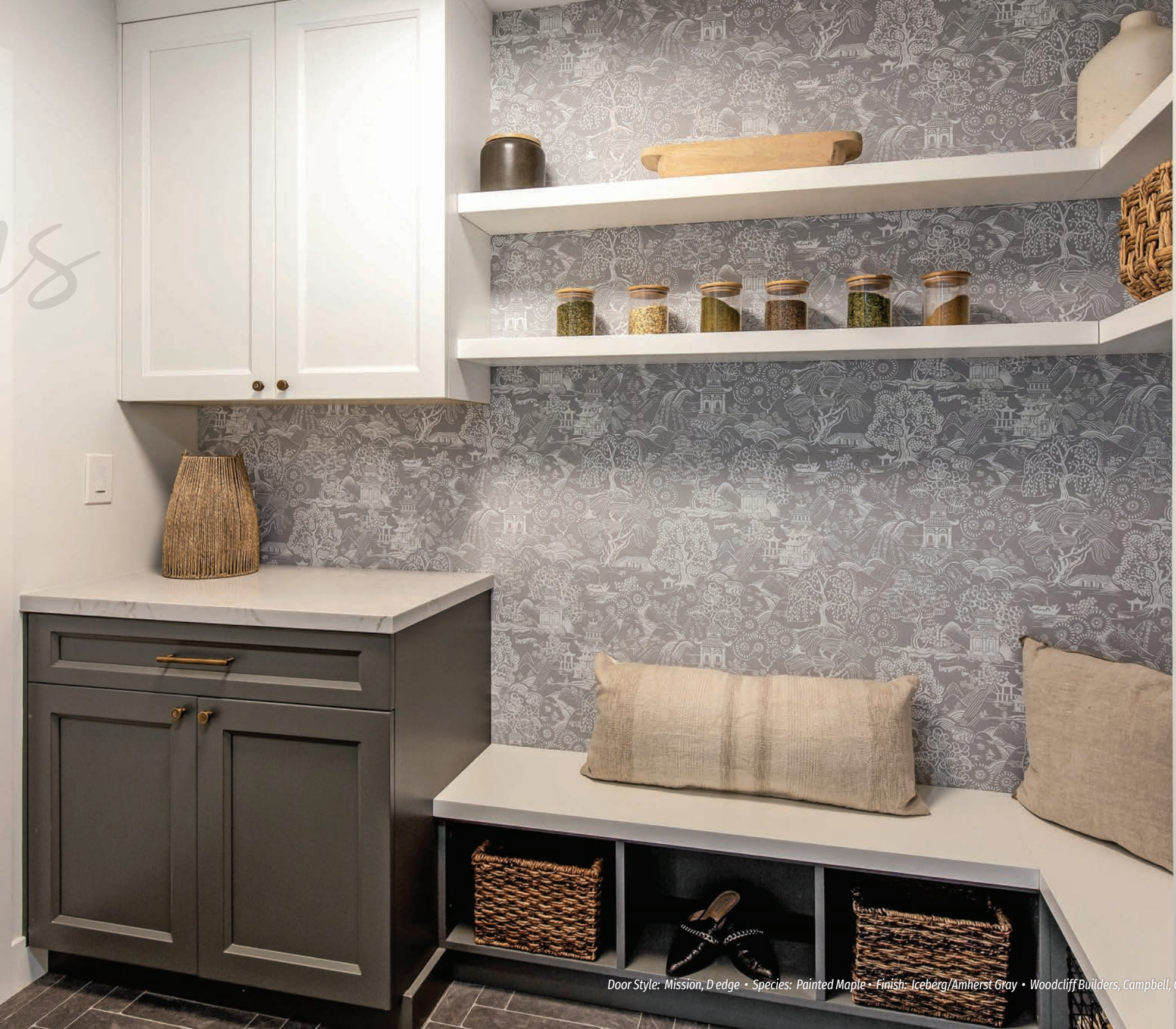
Door Style: Mission, D edge • Species: Painted Maple • Finish: Iceberg/Amherst Gray • Woodcliff Builders, Campbell, CA