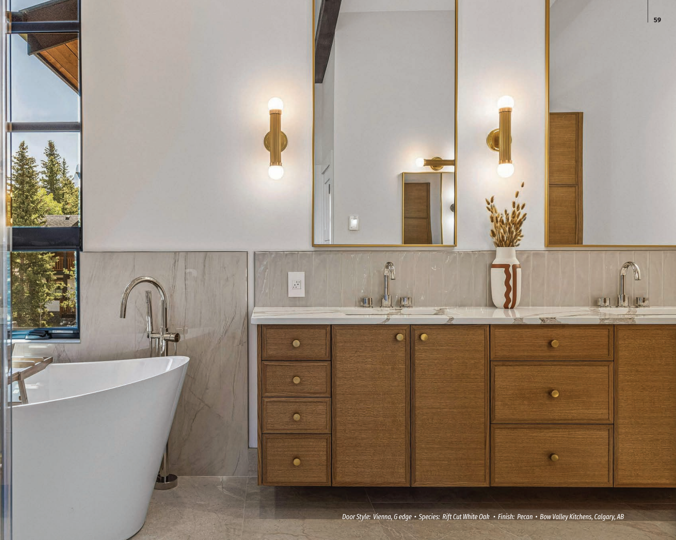
Door Style: Vienna, G edge • Species: Rift Cut White Oak • Finish: Pecan • Bow Valley Kitchens, Calgary, AB