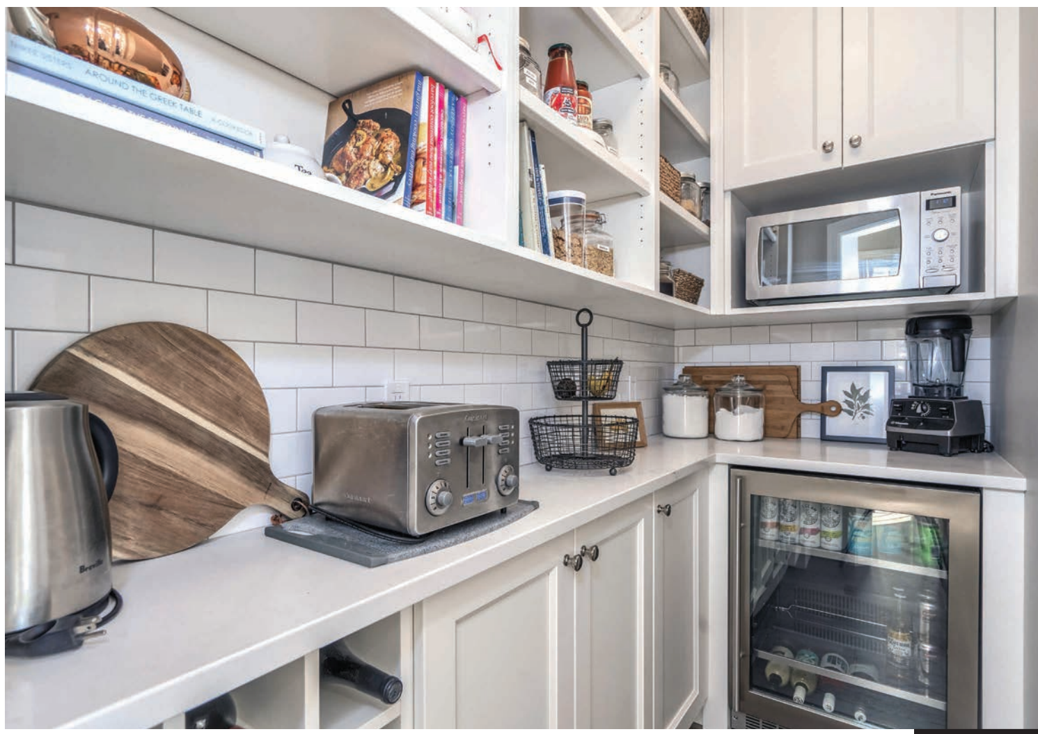
Door Style: Mission, D edge • Species: Painted Maple • Finishes: Cloud White • Blue Mountain Kitchens, Maple Ridge, BC