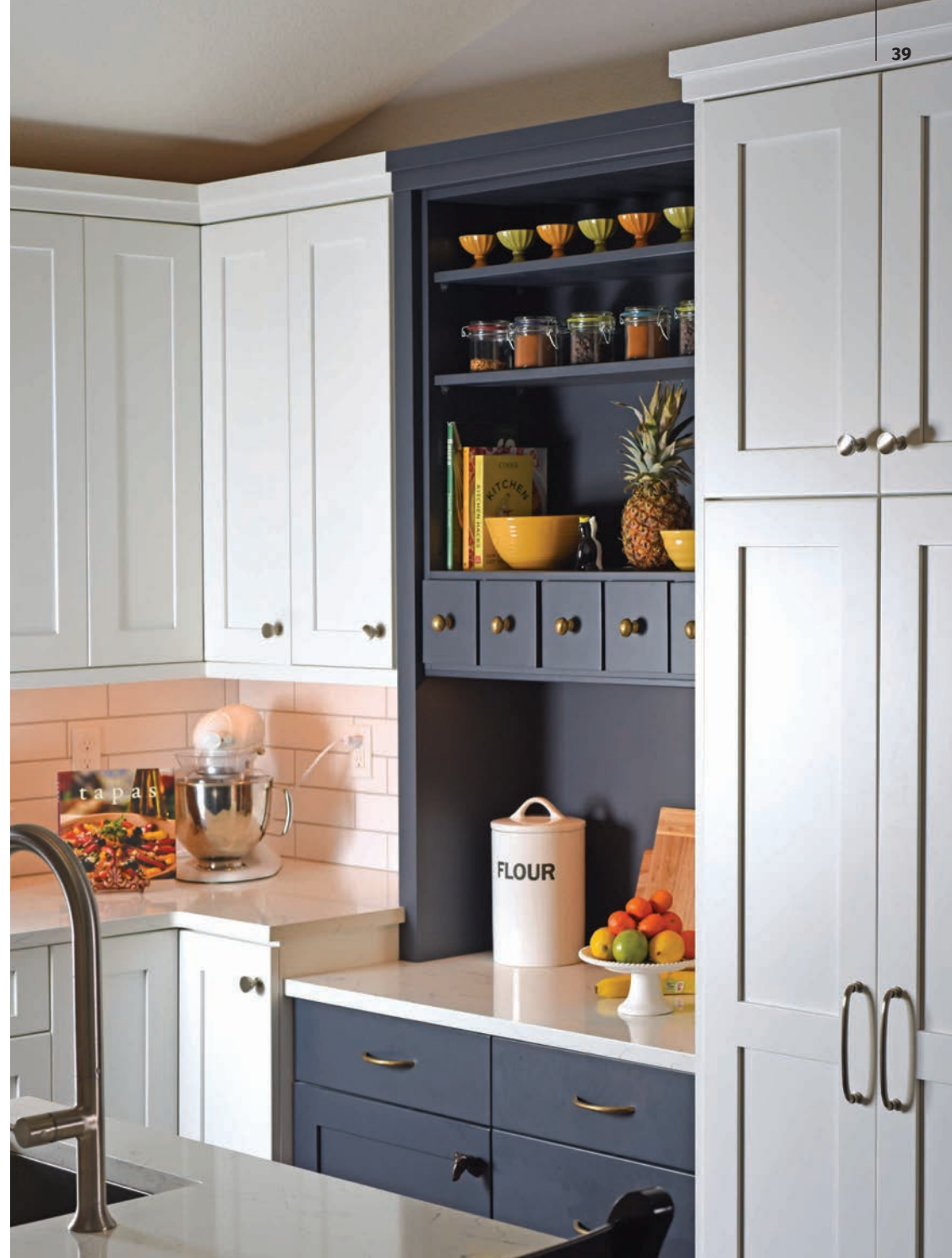
Door Style: Whistler, D edge • Species: Painted Maple • Finishes: Iceberg/Hale Navy • Sheila Off Design, Tacoma, WA