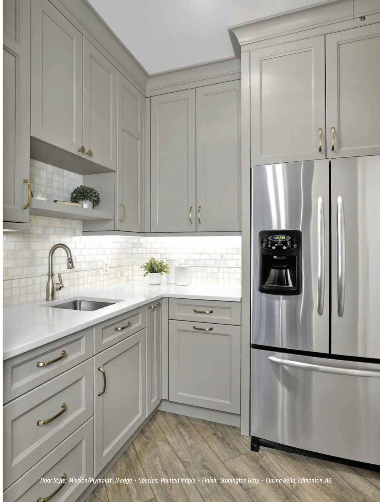
Door Style: Mission/Plymouth, N edge • Species: Painted Maple • Finish: Stonington Gray • Cucina Bella, Edmonton, AB