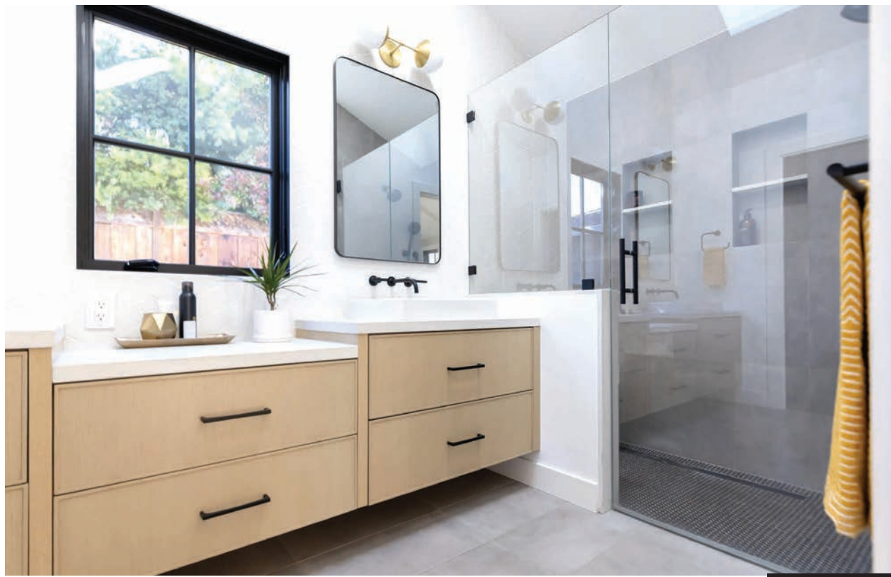
Door Style: Hereford, G edge • Species: Rift Cut White Oak • Finishes: Driftwood • Woodcliff Builders, Campbell, CA

Rid visual noise by tucking away the toothbrushes, cosmetics, and toiletries in a premium Sollera vanity where every item has its place, even the flat iron and hair dryer. The day's work clothes can easily be tossed in tilt-out laundry bins for washing another day. Store fluffy Egyptian cotton towels in linen towers. Display candles and your collection of bath salts on open shelving. Create a spectacular glass door apothecary cabinet. Select tranquil design elements to create a space where even Monday mornings are enjoyable and the stage is set for daily decompression.