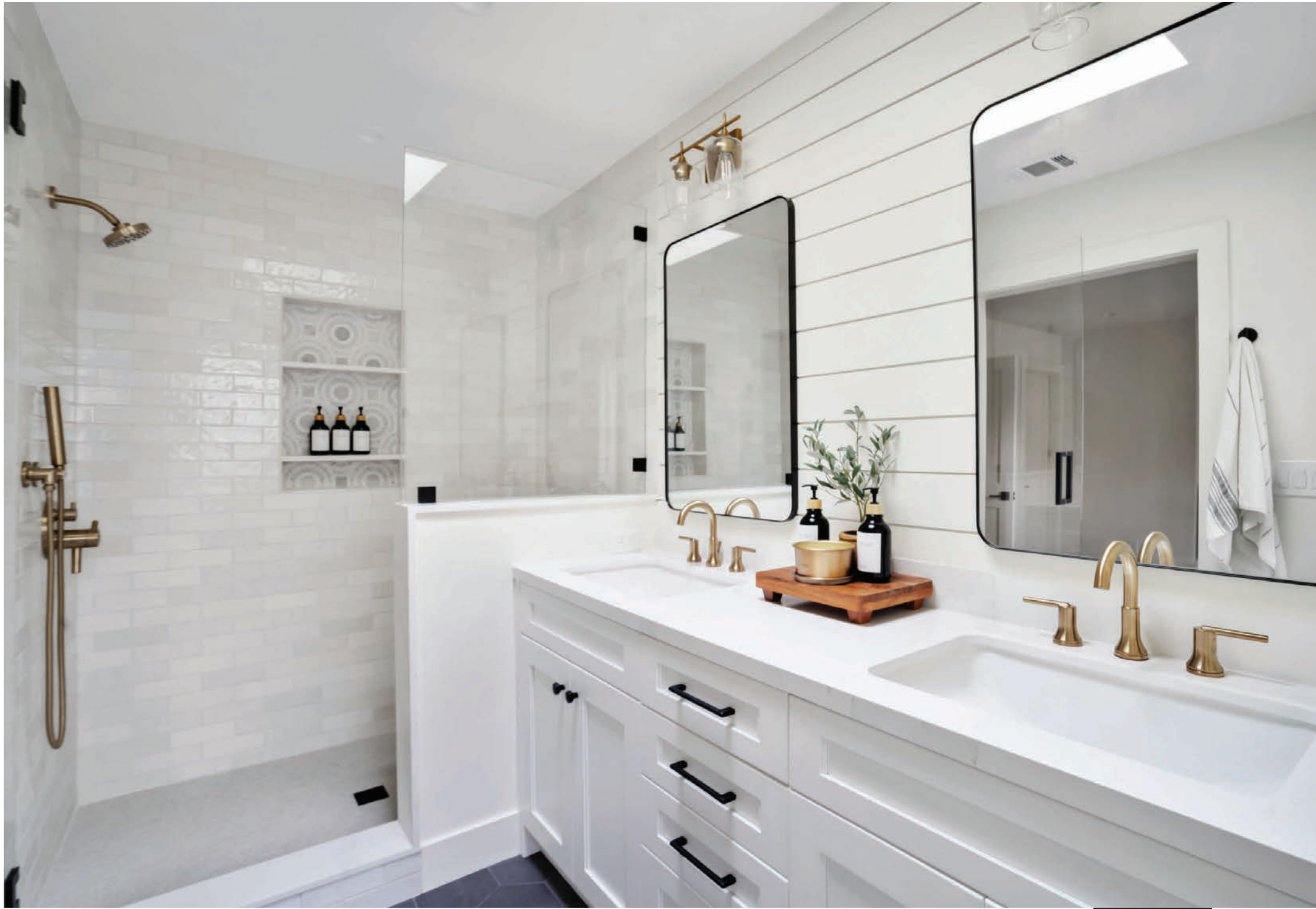
Door Style: Bradford, D edge • Species: Painted Maple • Finishes: Iceberg • Woodcliff Builders, Campbell, CA