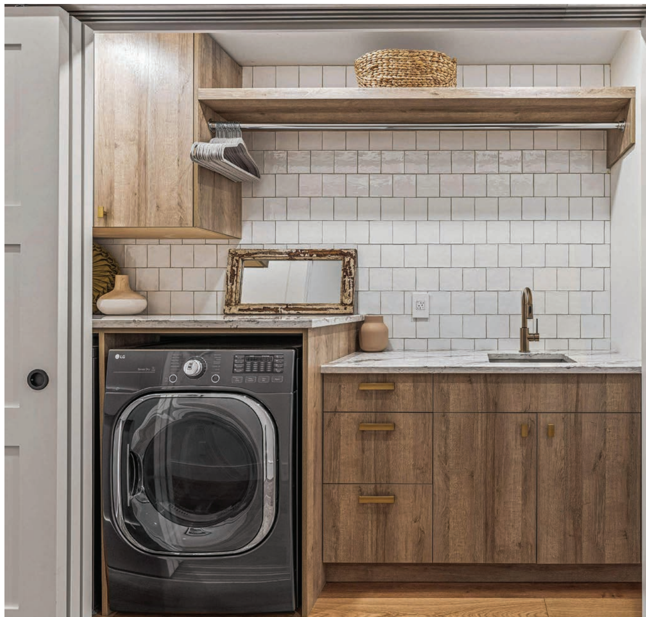
Door Style: Valencia/Dover, G edge • Species: TFL Registered Embossed laminate/HPL Super Matte High Pressure Laminate Finishes: Tobacco/Polaris Black • Bow Valley Kitchens, Calgary, AB