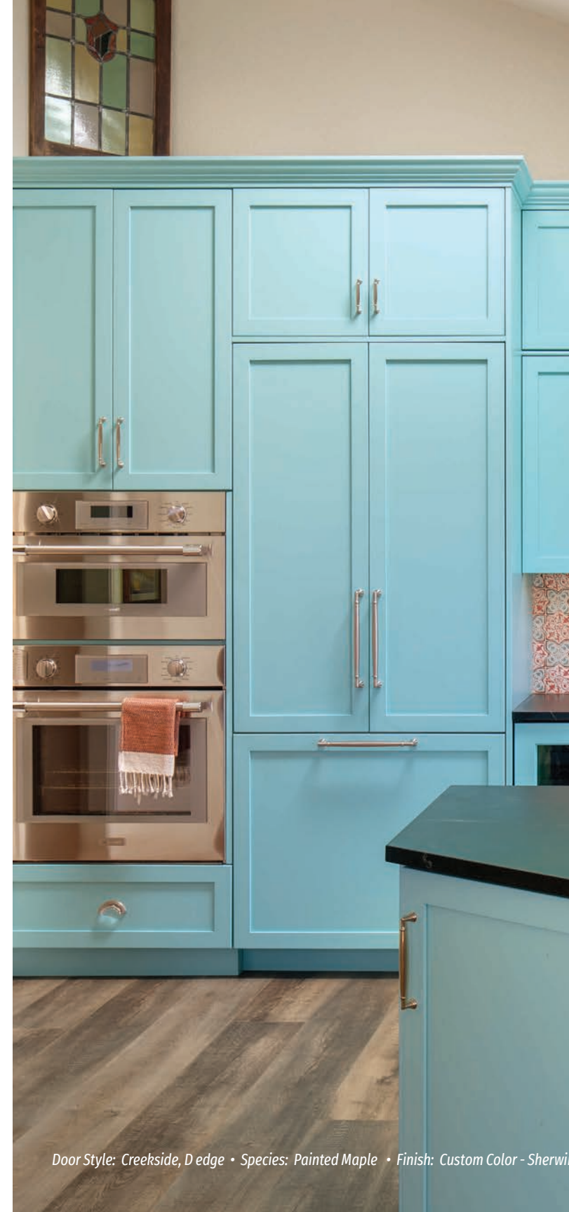
Door Style: Creekside, D edge • Species: Painted Maple • Finish: Custom Color - Sherwin