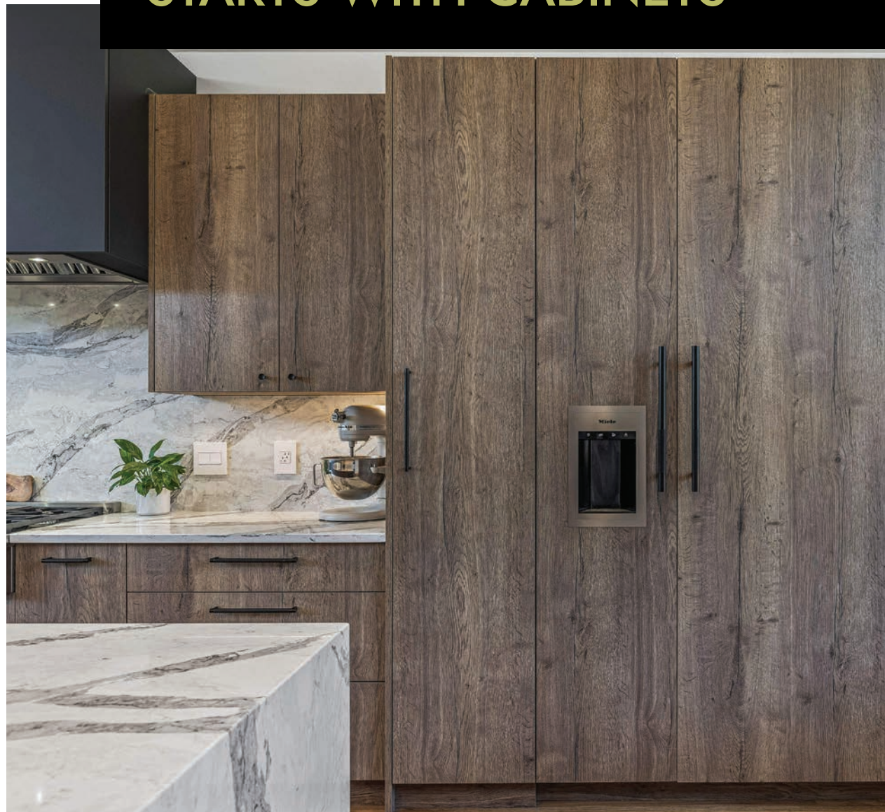
Door Style: Valencia/Dover, G edge • Species: TFL Registered Embossed laminate/HPL Super Matte High Pressure Laminate • Finishes: Tobacco/Polaris Black • Bow Valley Kitchens, Calgary, AB