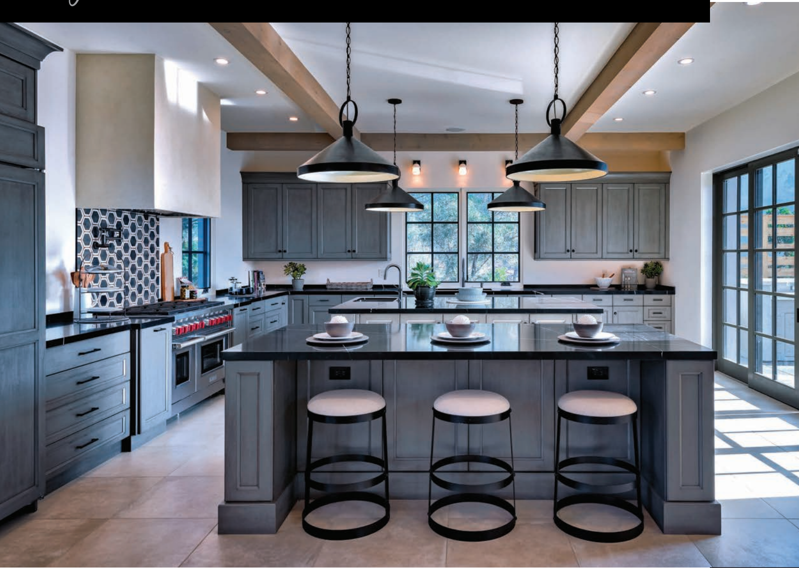
Door Style: Plymouth, H edge • Species: Clear Alder • Finish: Cottage Grey • DreamSpace Design, Santa Rosa, CA