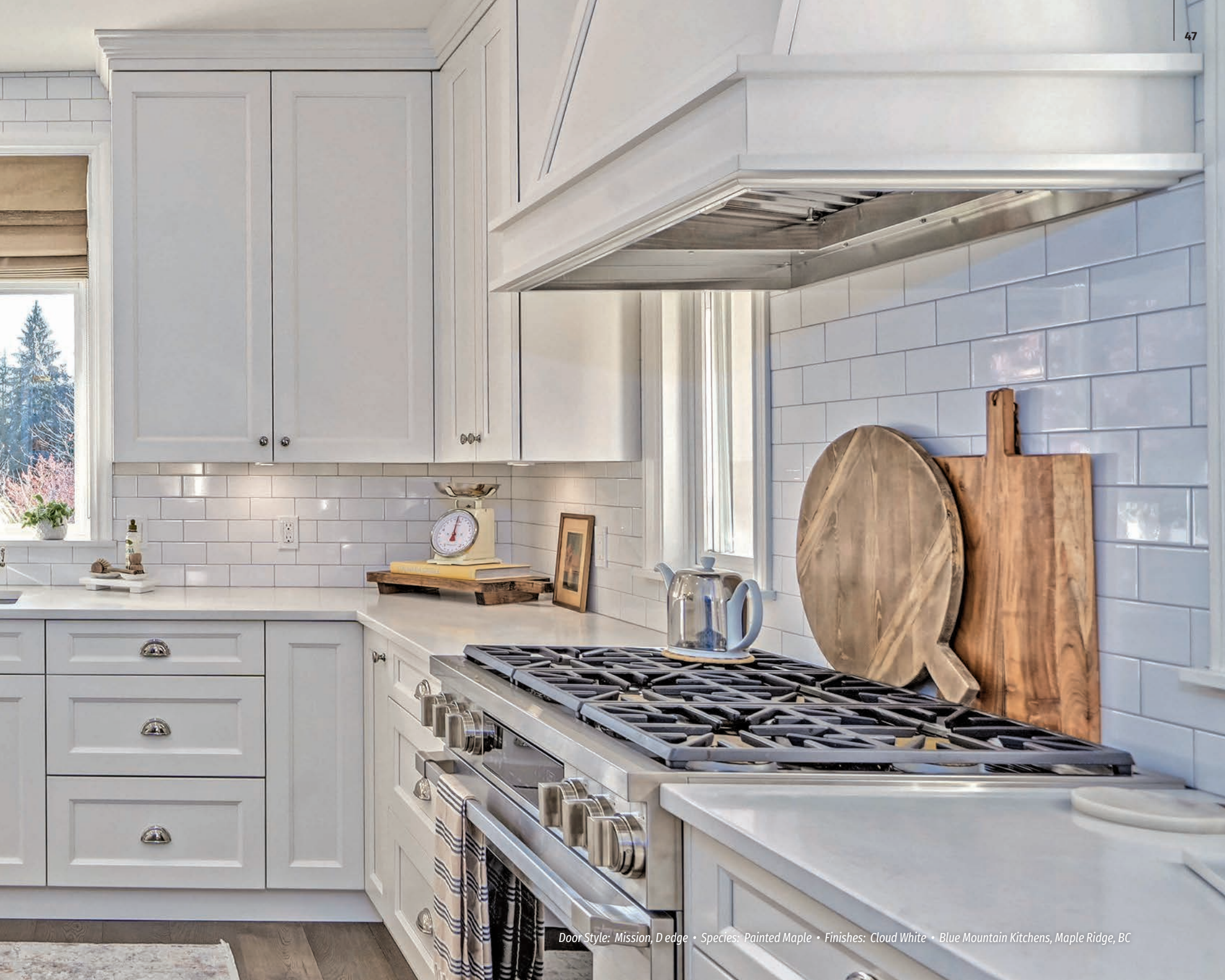
Door Style: Mission, D edge • Species: Painted Maple • Finishes: Cloud White • Blue Mountain Kitchens, Maple Ridge, BC