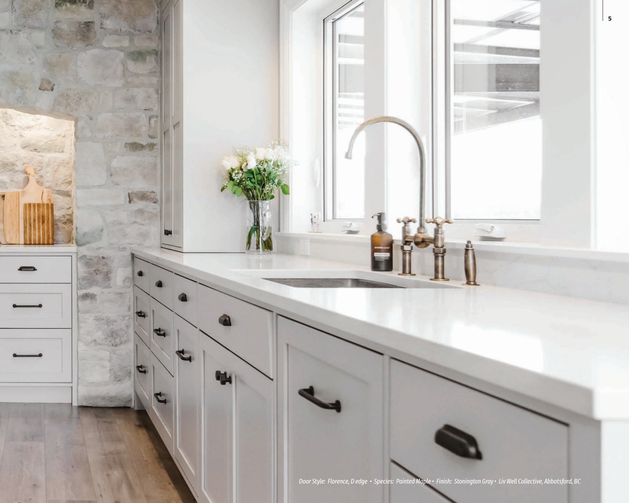
Door Style: Florence, D edge • Species: Painted Maple • Finish: Stonington Gray • Liv Well Collective, Abbotsford, BC